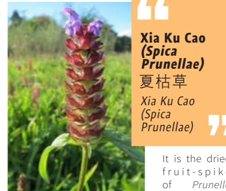
Xia Ku Cao ( Spica Prunellae ) 夏枯草 Xia Ku Cao ( Spica Prunellae )

Tambahan lagi, terdapat pelbagai jenis teh herba di pasaran dan setiap satu daripadanya telah dicipta bagi tujuan tertentu kepada kesihatan. Merujuk kepada Farmakopeia Cina, terdapat pelbagai jenis herba yang boleh mengurangkan atau menyingkirkan panas dari badan. Sebagai contoh Xia Ku Cao ( Spica Prunellae ), Gan Cao ( Radix Glycyrrhizae ), Daun Pudina ( Herba Menthae ), Aloe vera ( Aloe Barbadensis ), Xian Feng Cao ( Herba Bidentis ) dan lain-lain lagi [1] .