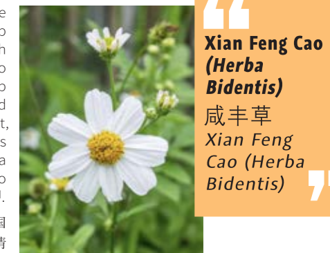
Xian Feng Cao ( Herba Bidentis ) 咸丰草 Xian Feng Cao ( Herba Bidentis )