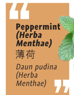
Peppermint ( Herba Menthae ) 薄荷 Daun pudina ( Herba Menthae )

Gan Cao yang juga dikenali sebagai licorice root adalah akar dan rizom dari Glycyrrhiza uralensis Fisch., Glycyrrhiza inflata Bat. atau Glycyrrhiza glabra L. yang telah dikeringkan dan dipungut pada musim bunga dan musim luruh, dilepaskan dari anak akar dan dikeringkan di bawah matahari [1] . Selain itu, Gan Cao adalah sejenis tumbuhan yang digunakan dalam perubatan berasaskan herba oleh kebanyakan budaya [3] . Ianya boleh dimakan atau digunakan secara luaran bagi membuang haba badan dan menyingkirkan toksin [4] .