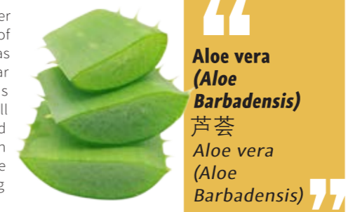
Aloe vera ( Aloe Barbadensis ) 芦荟 Aloe vera ( Aloe Barbadensis )

Aloe vera adalah sejenis tumbuhan hebat yang mempunyai pelbagai faedah kepada kesihatan. Ianya adalah salah satu daripada ramuan terkenal sejak beribu tahun yang lampau dan masih digunakan secara meluas sehingga hari ini untuk mengekalkan suhu badan pada kadar yang optimum oleh kerana cirinya yang menyejukkan [5] .