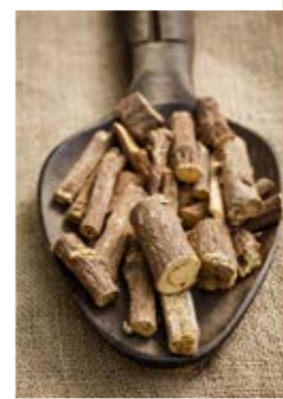
Gan Cao ( Radix Glycyrrhizae ) 甘草 Gan Cao ( Radix Glycyrrhizae )

In Europe and the Americas, this herb is known as Spanish needle, which is also considered as a herb that can clear heat and toxins [6] . Besides that, it can also be used as an iced beverage or tea in the summertime to relieve summer-heat [7] .